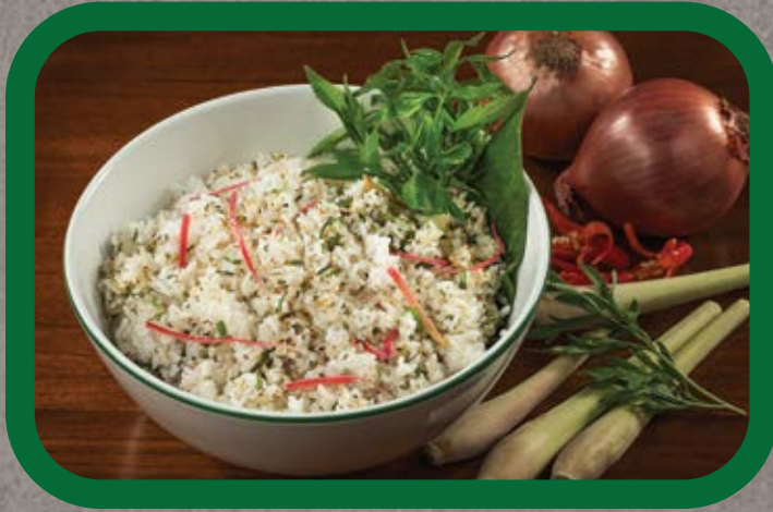
Nasi Ulam RM20

Steamed rice tossed with a mix of fresh local herbs, shredded coconut, and zesty aromatic spices, served chilled for a light, fragrant experience.